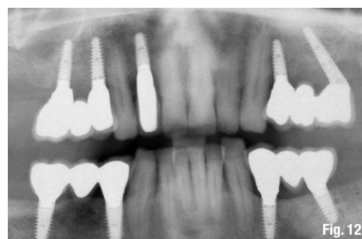
Fig. 12 Orthopantomogram after restoration.

Figs. 10 & 11 The implants loaded with final metal ceramic FPDs.